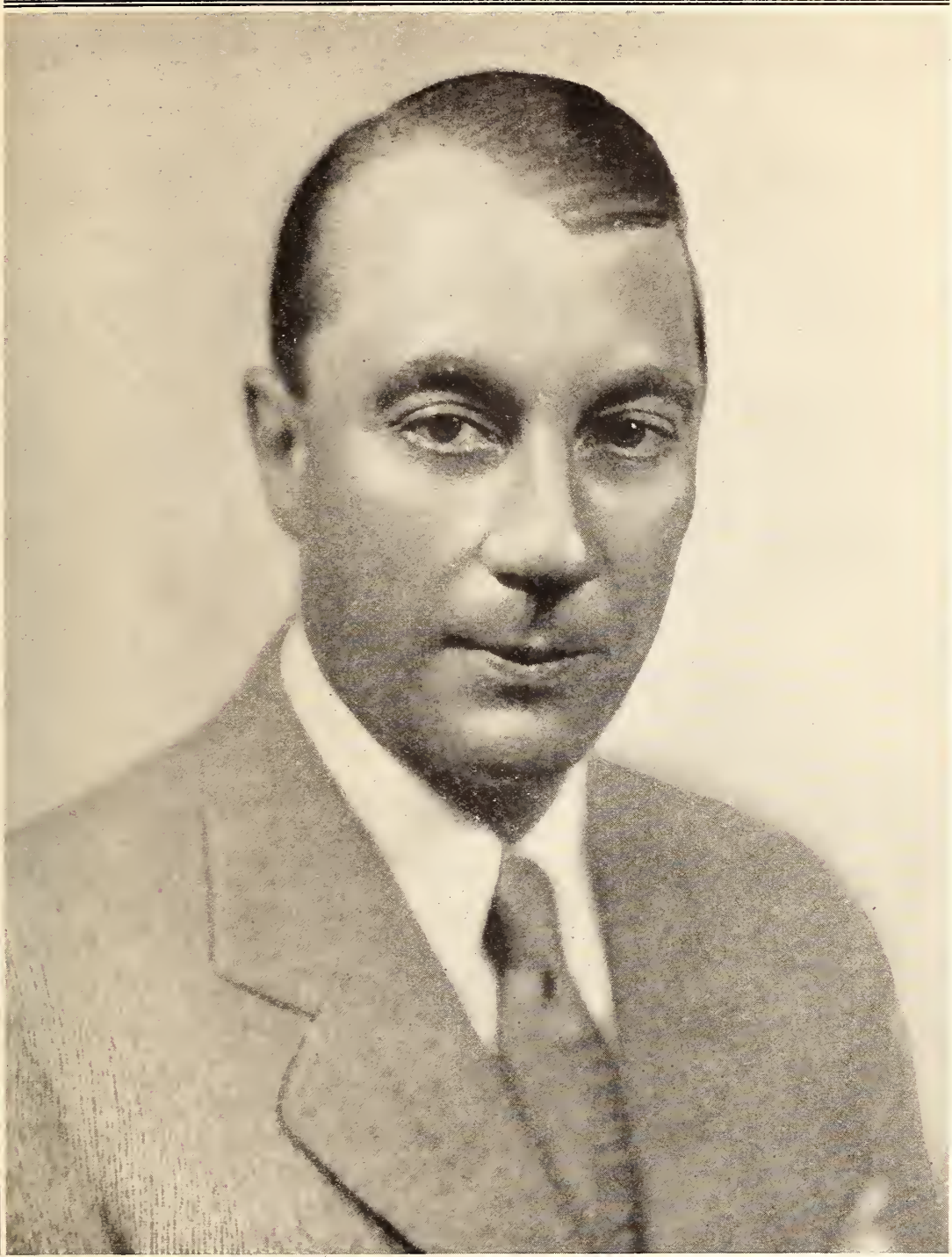
GRAHAM McNAMEE — NBC Announcer