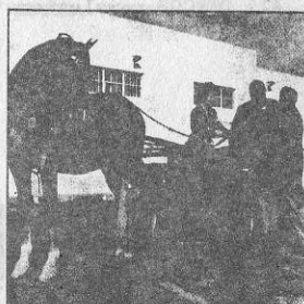
GEORGE BURNS and Gracie Allen rented this equipage; but by the looks of the horse, he may decide to balk if bandman Paul Whiteman's generous poundage is added to his load