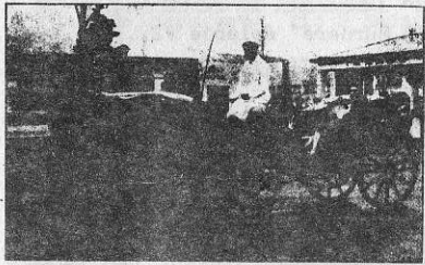
ONE of first stars to launch gas- and fire-saving stunt was Lorette Young, who gave fans a thrill by adopting old-fashioned carriage as carry-all cab