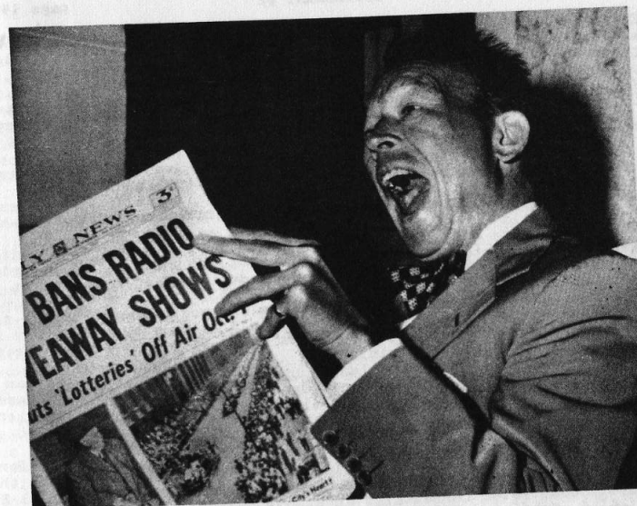
His own show having been bumped from the air by one of the giveaway shows, comedian Fred Allen is gleeful over the FCC's 1949 decision to ban them.