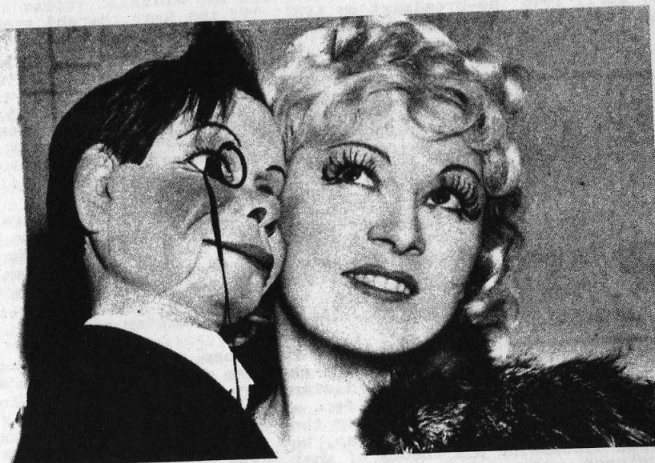
In 1937 Mae West did an Adam and Eve skit with Charlie McCarthy and proved radio could be off-color.