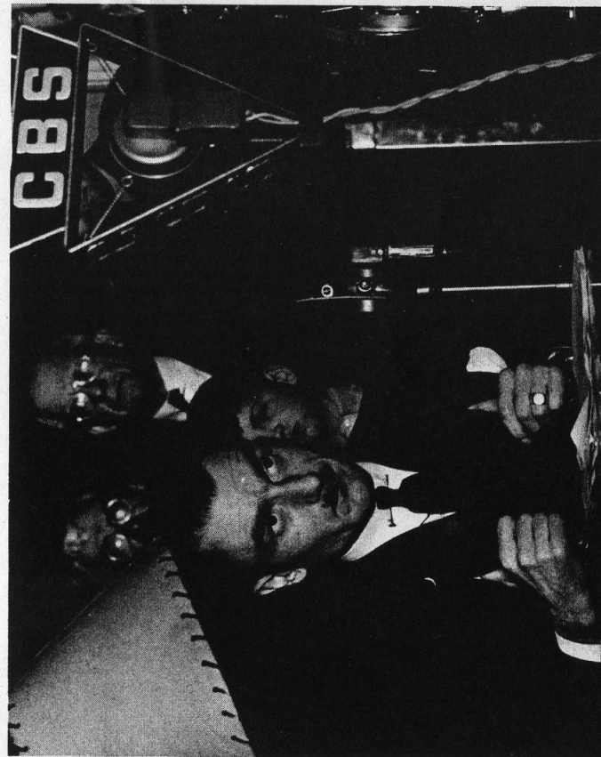
Commentator Boake Carter, on the scene at the trial of Bruno Hauptmann, Flemington, N.J., 1935.