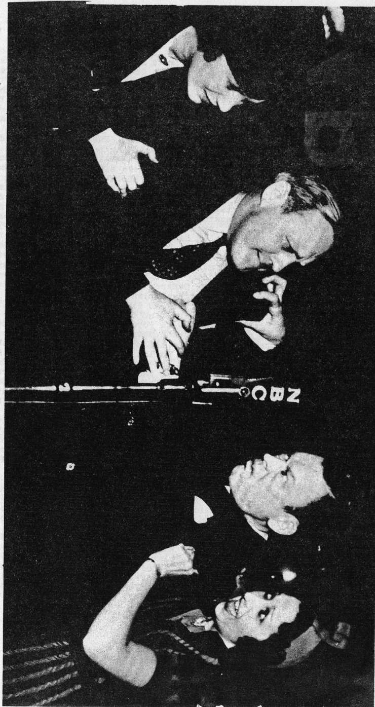
The Benny-Allen feud—a highly-posed tableau. Left to right, Portland, Jack Benny, Fred Allen, and Mary Livingstone, Benny's wife.