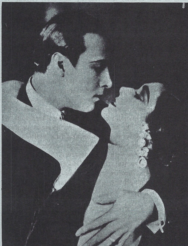
A rare shot from Cobra shows Valentino with Nita Naldi. She was a favorite of Mrs. Valentino. Picture had slow b.o. start. But in The Sheik (left) the Valentino charm caught fire.