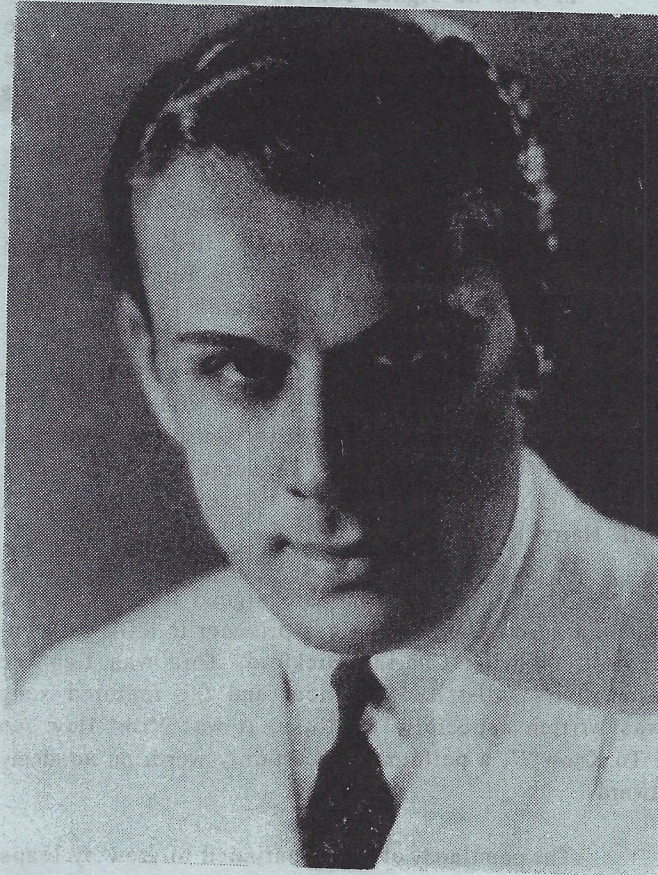
January 14, 1908 RUSS COLUMBO September 2, 1934