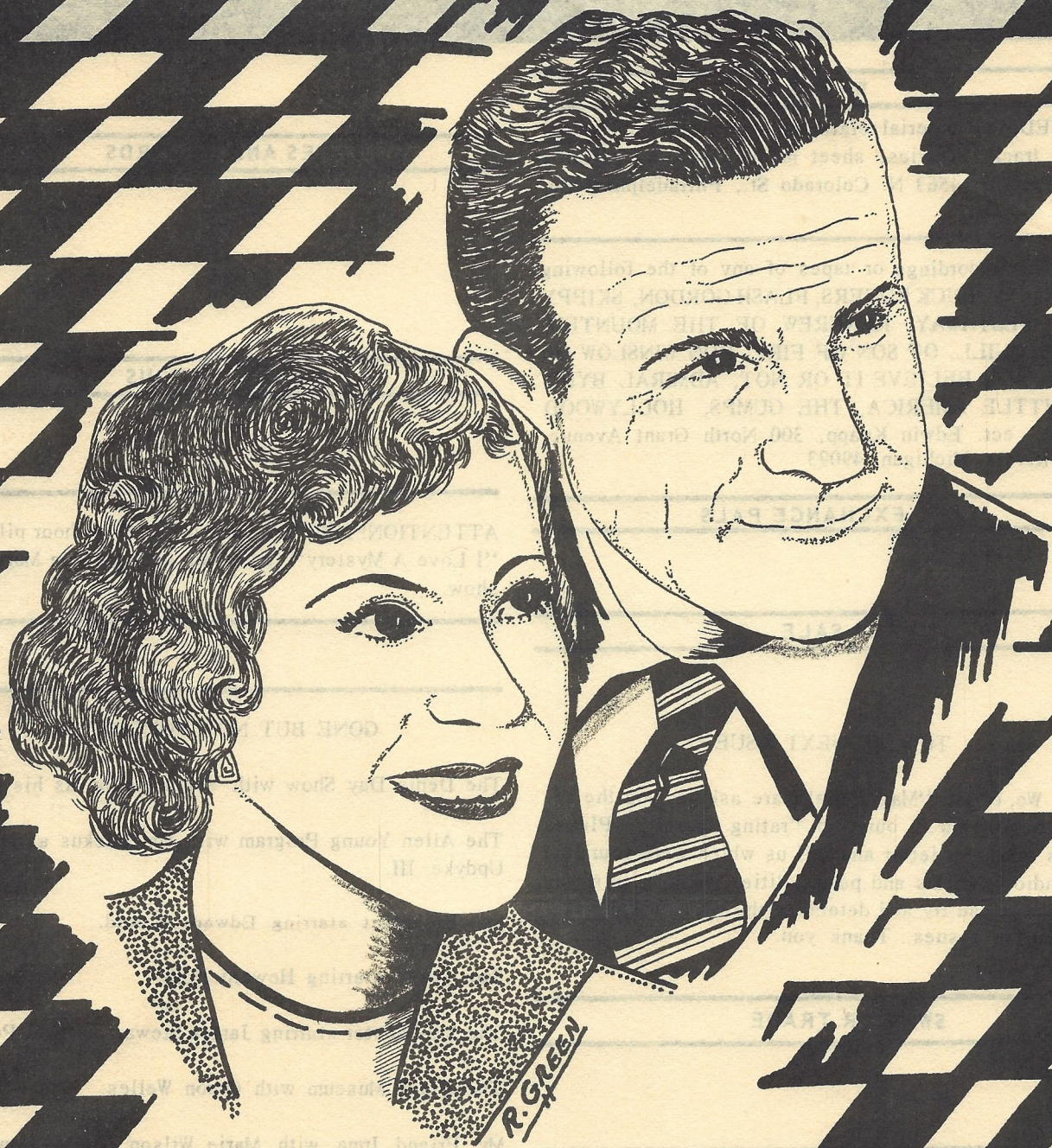
George Burns Gracie Allen