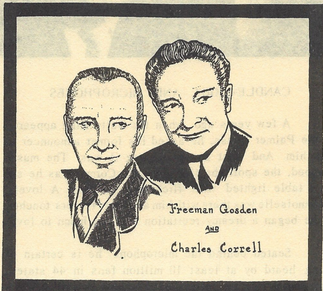
Freeman Gosden AND Charles Correll

In the next issue of the Magic Dial there should be something for everyone, including an illustrated history of radio from its birth, including the formation of the networks. Also featuring some great in the radio field. Original art and illustrations galore. Perhaps even a few surprises, both to you and us alike. Please tune in, we would love to have you.