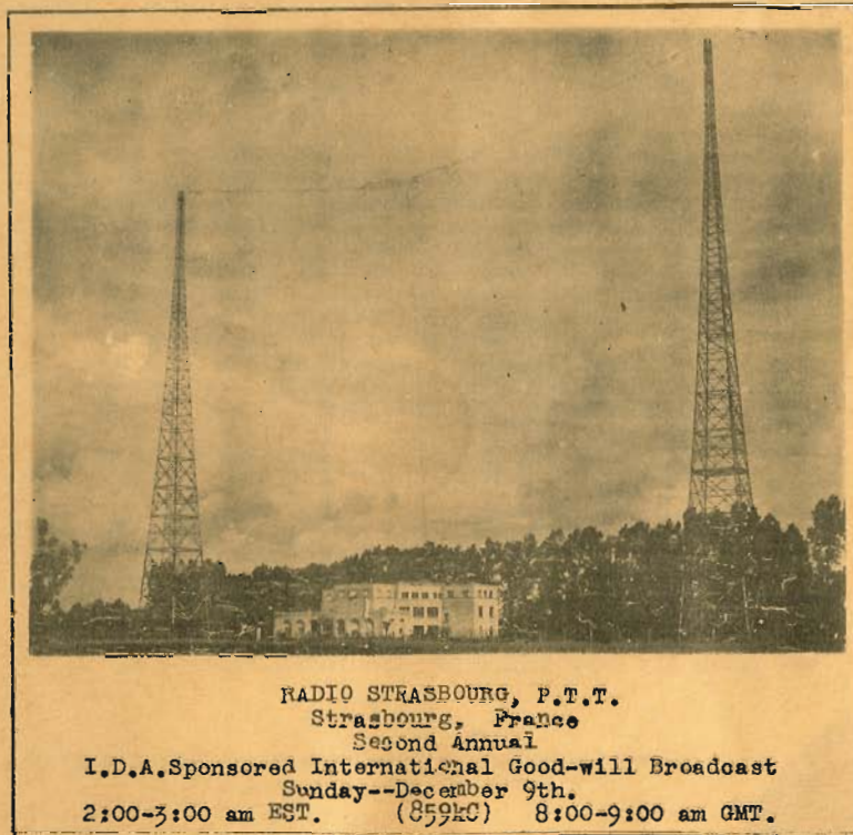
RADIO STRASBOURG, P.T.T. Strasbourg, France Second Annual

I.D.A. Sponsored International Good-will Broadcast Sunday--December 9th. 2:00-3:00 am EST. (859kc) 8:00-9:00 am GMT.