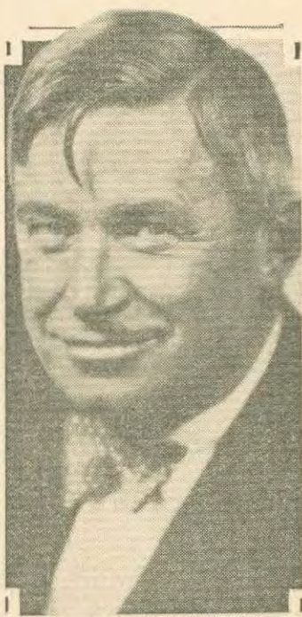
WILL ROGERS, American jester extraordinary, comments on world news each Sunday at 9.30 P. M., over the CBS-WABC chain.