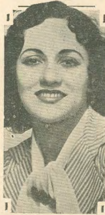
CONNIE BOSWELL, one of the three BOSWELL Sisters who appear with BING CROSBY on his CBS-WABC program Tuesdays at 9 A.M.