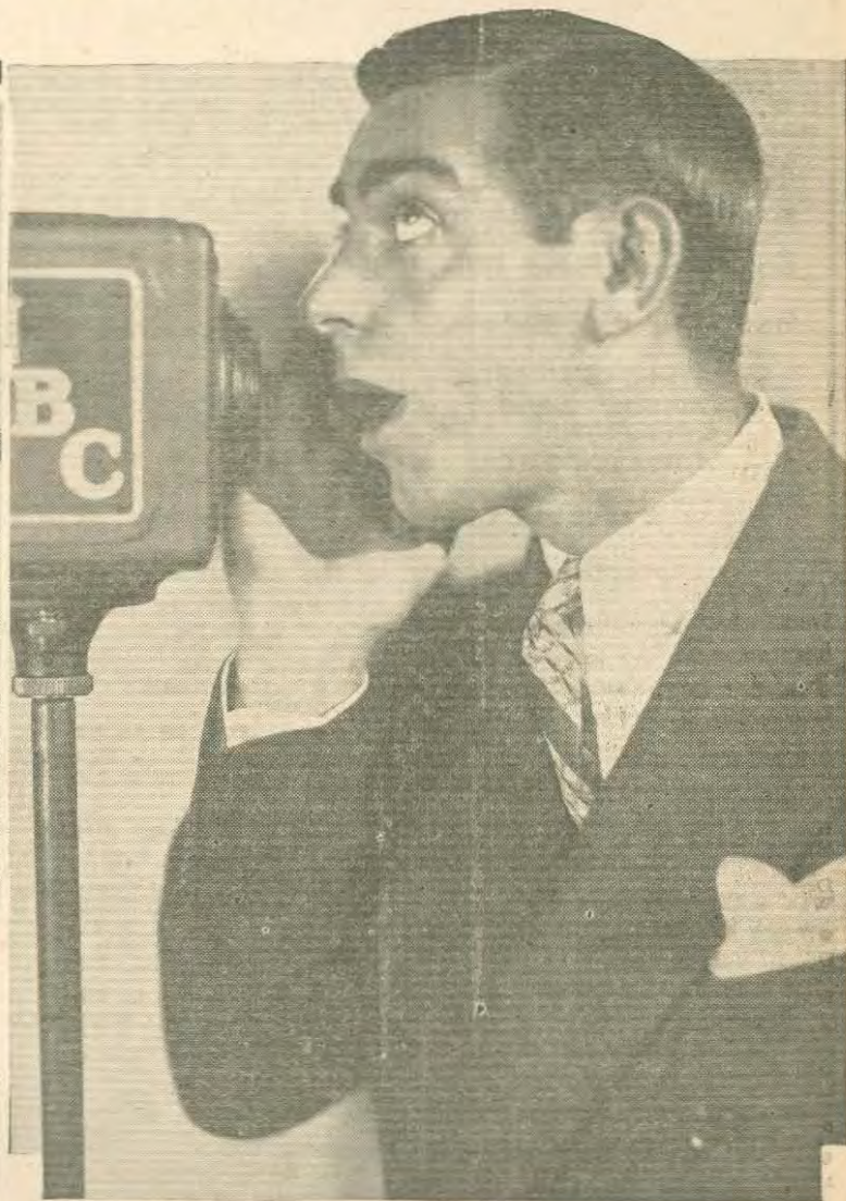
EDDIE CANTOR, famous comedian, whose programs over the NBC-WEAF chain on Sundays at 8 P. M. have won him many friends.