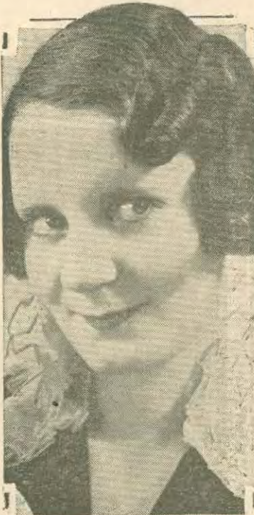
PORTLAND HOFFA, otherwise known as Mrs. FRED ALLEN, aids and abets her husband during their program broadcast Wednesdays from 9 to 10 P.M., on the NBC-WEAF chain.