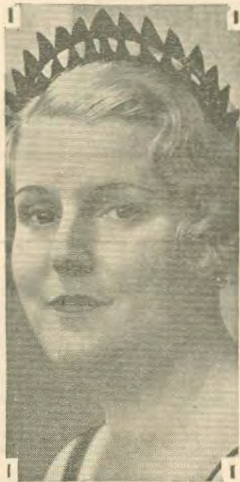
GRETE STUECKGOLD, concert soprano, is soloist with the KOSTELANETZ Orchestra each Saturday evening at 9 on the CBS-WABC chain.