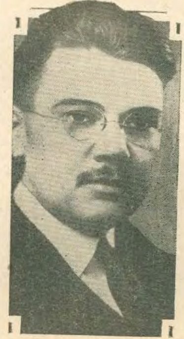
BRUCE BLIVEN, editor of The New Republic , sees government control as the salvation of radio.