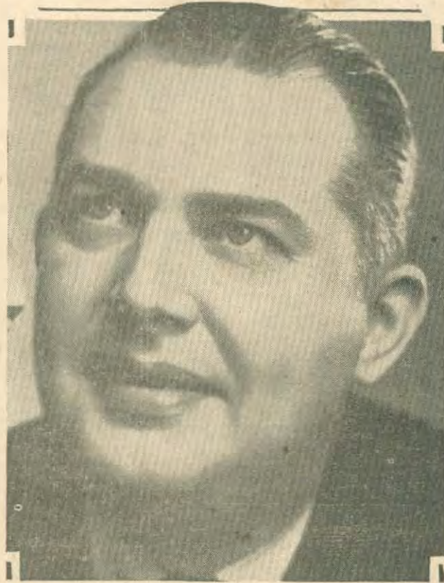
"WHISPERING" JACK SMITH, radio and record artist, whose bad cold brought him fame. He is heard over the WABC-Columbia network every Tuesday, Thursday and Saturday at 7.30 P. M.

One day when he dropped in to watch a friend perform over WMCA at the McAlpin Hotel, the engineer asked Smith to go on the air. The expected artist hadn't arrived. Ordinarily Jack would have been glad to fill in. But he had a bad cold that day and couldn't talk above a whisper. The engineer was insistent. So Smith, in a husky voice, reluctantly sang a couple of songs. The next day brought mail from fans all over the city, demanding more programs by the "whispering" baritone.