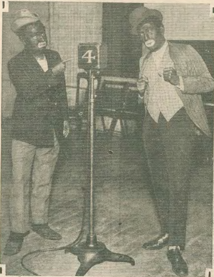
SAWDUST and MOONSHINE, blackface comedians of the weekly Corn Cob broadcast.

into the program and frequently bring in new talent, always from the district, to add a new note.