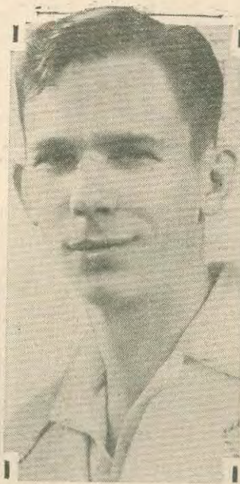
ELLSWORTH VINES, Jr., noted tennis player, talks on the fine points of the game over the NBC-WEAF network Sundays at 9.30 A. M.