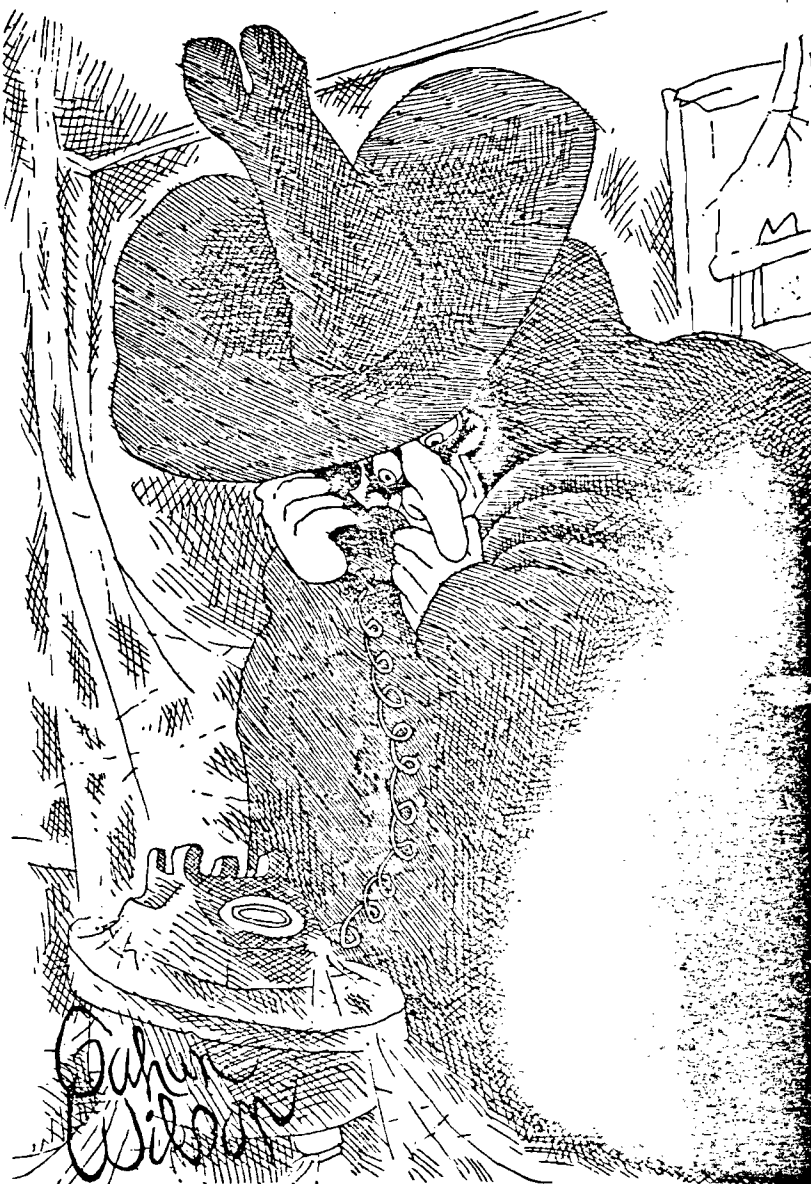
"Lamont Cranston? No, there's no Lamont Cranston here."

EXTRAS: Attached to this issue is the first of our "extras", the script for the 1000th broadcast of THE LONE RANGER. Future extras will include more scripts, articles and other items of interest to OTR collectors.