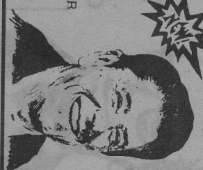
"THE REAGAN TAPES!"