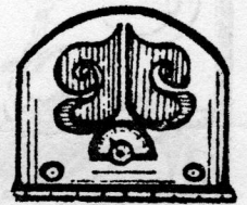
DOUBLE-R-RADIO "The Sounds Of Yesterday"