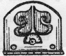
DOUBLE-R-RADIO "The Sounds of Yesterday"