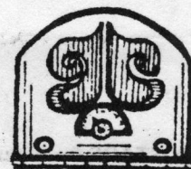
DOUBLE-R-RADIO "The Sounds Of Yesterday"