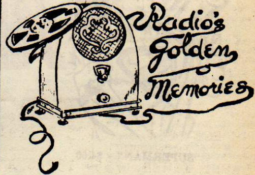
"RADIO'S GOLDEN MEMCRIES" - $4.50