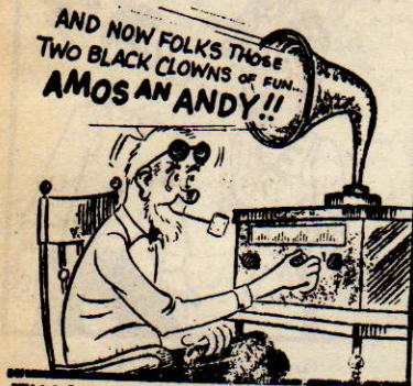
THOSE WERE THE DAYS!