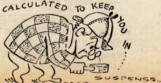
"CALCULATED TO KEEP YOU IN SU PENSE" - $3.75

WE ALSO MAKE NAME & ADDRESS STAMPS FOR YOUR LETTERS. PRICES SENT ON REQUEST.