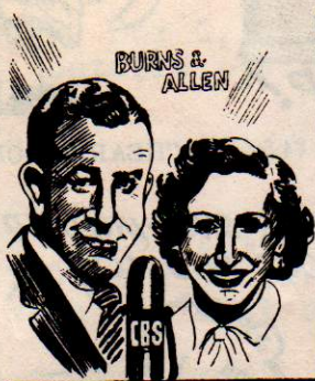
Burns & Allen-$3.75