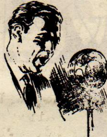
"MAN AT MIKE" - $2.75

DEAR SIR... INCLOSED... 2 BOX TOPS AND 10¢