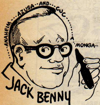
"JACK BENNY" - $4.50