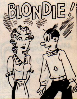
"BLONDIE" - $4.95