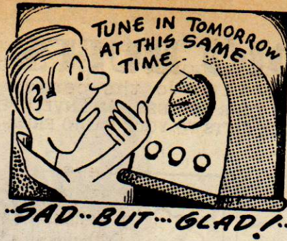
"TUNE IN TOMORROW" - $4.50