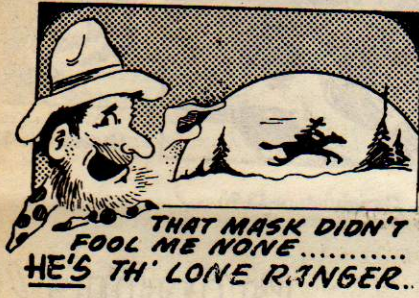
"TH' LONE RANGER" - $4.35