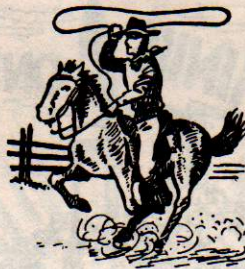
"COWBOY" - $3.25