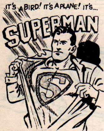
"SUPERMAN" - $4.50