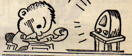
"DEAR SIR-INCLOSED 2 BOX TOPS" - $3.75

DEAR SIR... INCLOSED... 2 BOX TOPS AND 10¢