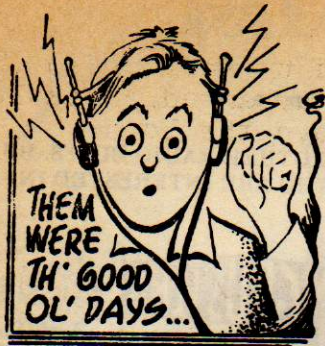
"TH' GOOD OL' DAYS" - $4.25