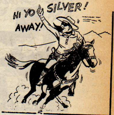
"HI YO SILVER!" - $4.85