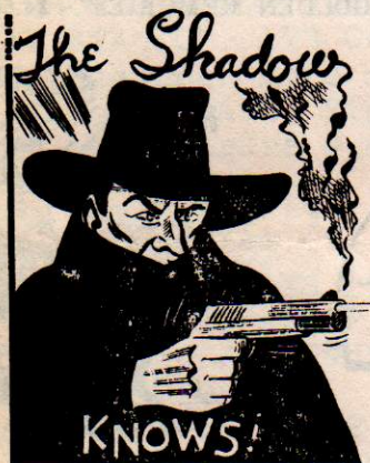
"THE SHADOW" - $4.75