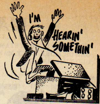
"HEARIN' SOMETHIN'" - $4.25