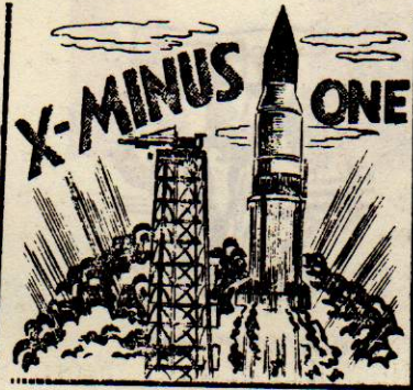
"X - MINUS ONE" - $5.00