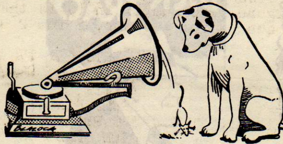
"HIS MASTER'S...?" - $4.75