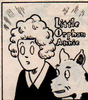
Little Orphan Annie 3.75