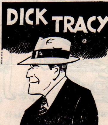
"DICK TRACY" - $4.25