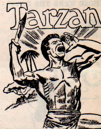
"TARZAN" - $4.25

SEND YOUR ORDERS TO: RADIO'S GOLDEN MEMORIES 2860 S. E. 20th Avenue Gainesville, Fla. 32601