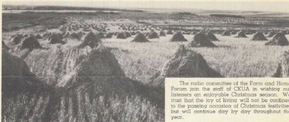
BREADBASKET —The area shown above looks large—it's only a portion of one farm among many served by the Alberta Farm and Home Forum.

Mondays, Wednesdays and Fridays, 8:15 to 8:30 p.m.