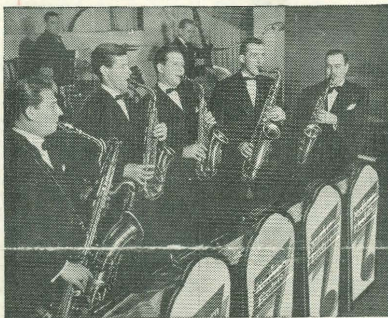
MART KENNEY, the Vancouver man who has become a name in Canadian popular music, had dropped his baton and picked up a saxophone when this recent picture was taken. The Western Gentlemen are moving across the Dominion on a week-to-week tour, with broadcasts each Monday night in the Electric Hour (CBC Dominion Network, Mondays, 6:00 p.m.) Kenney is at the extreme right in the picture.