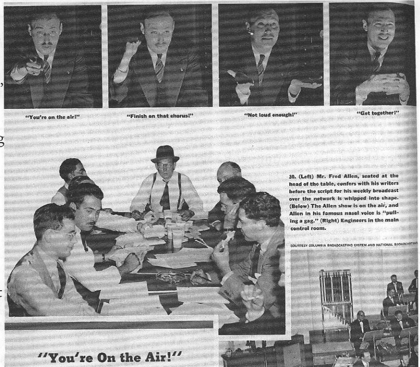
30. (Left) Mr. Fred Allen, seated at the head of the table, confers with his writers before the script for his weekly broadcast over the network is whipped into shape. (Below) The Allen show is on the air, and Allen in his famous nasal voice is "pulling a gag." (Right) Engineers in the main control room.

• A Tex Ritter double-feature or two for Showcase attendees who spent their childhoods at the Saturday matinees.