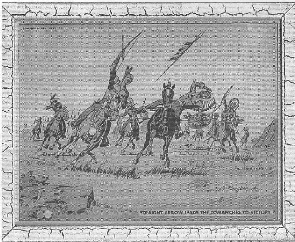
STRAIGHT ARROW LEADS THE COMANCHES TO VICTORY

The Outlet will also be stocked with CDs of uncirculated material from ET discs featuring the likes of Bob Hope, Jack Benny, Phil Harris and Alice Faye, Jimmy Durante, Red Skelton, Eve Arden and Blackstone. Attendees may also buy DVDs of "I Remember Mama" episodes and recreations from the 2005 Showcase.