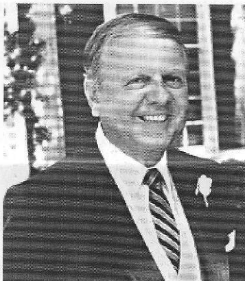
Dick Van Patten