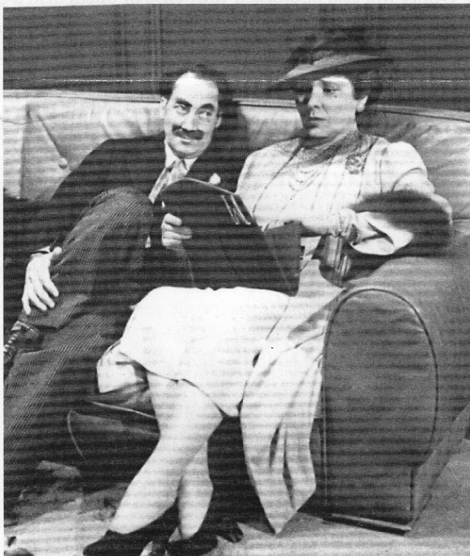
Margaret Dumont and antagonist Groucho Marx