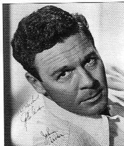
▲ The Shadow and so much more.