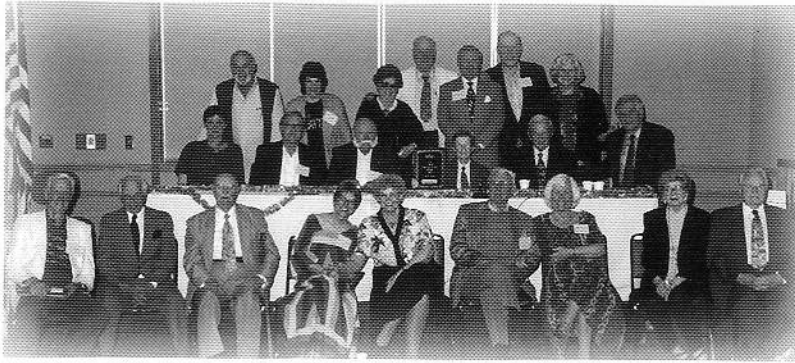
▲ Our special friends from Showcase V. To the best of our knowledge, there is no other gathering/convention where the entire group is together for such a photo. Did you ever try to add up the years of experience represented by our Showcase guests? Or the number of shows in which they have all been involved? These Showcase gatherings are significant events. Let's never take them for granted.

Families." It is far too early to have any more specific details, but there are some very promising program possibilities that have already been discussed.