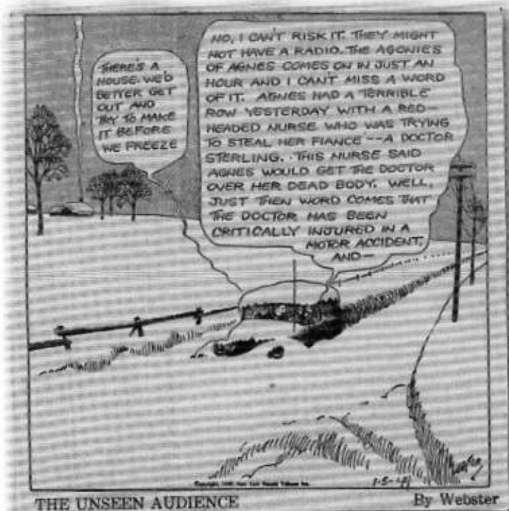
▲ From the January 5, 1949 issue of the New York Herald Tribune