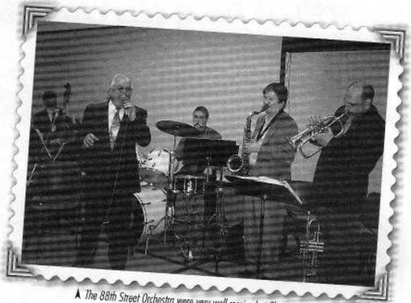
▲ The 88th Street Orchestra were very well received at Showcase VII.