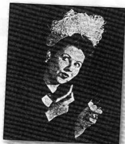
▲ Sandra Gould as 'Miss Duffy' from Duffy's Tavern ▼