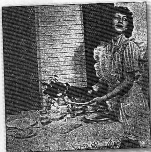
▲ Peg Lynch as 'Ethel Arbuckle' from The Private Lives of Ethel & Albert