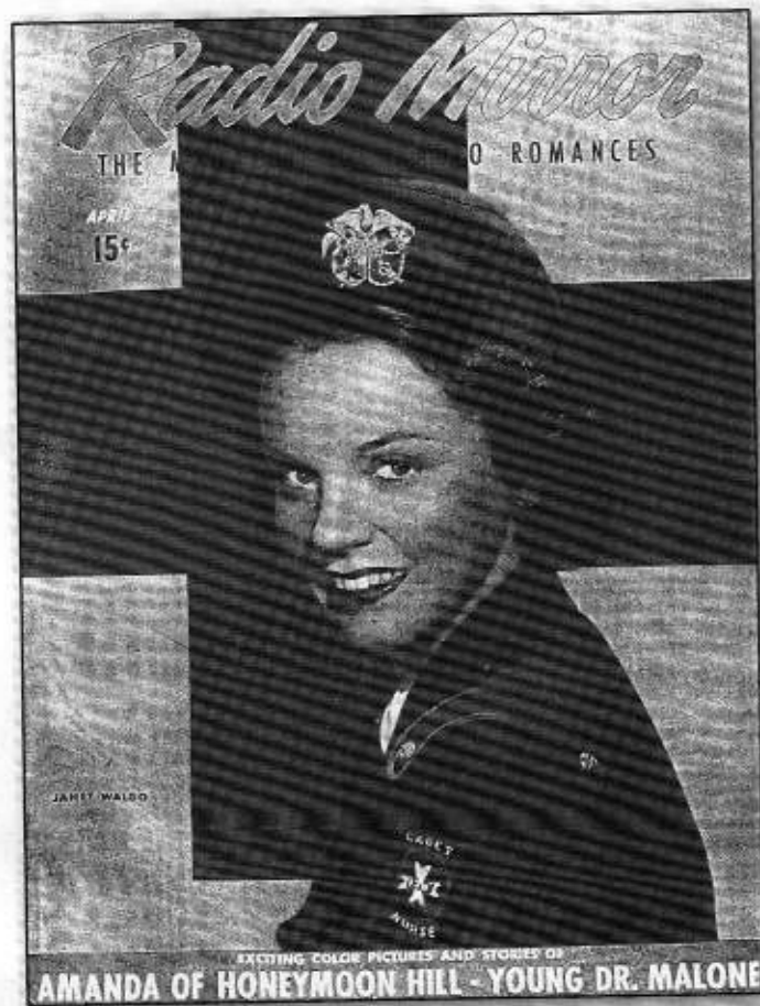
▲ Janet Waldo on the cover of 'Radio Mirror'