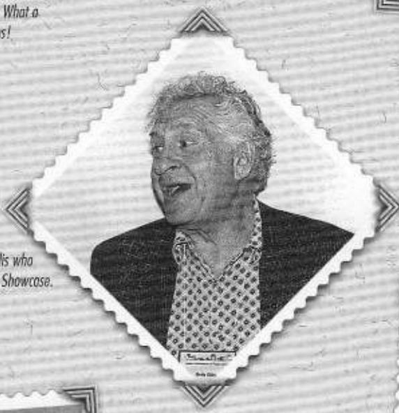
➤ Mr. Nice Guy, Herb Ellis who adds so much class to the Showcase.