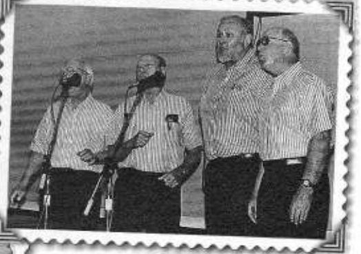
▲ "Have you tried Wheaties?" Can't you just hear the Harmonious Accord quartet as they work on "Jack Armstrong"?