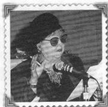
▲ Honorary member Sandra Gould as she acted at the last Showcase. Sandra passed away recently.

A fixture at many OTR gatherings over the years, Sandra Gould will be missed by fans everywhere, and most certainly by the folks of REPS.